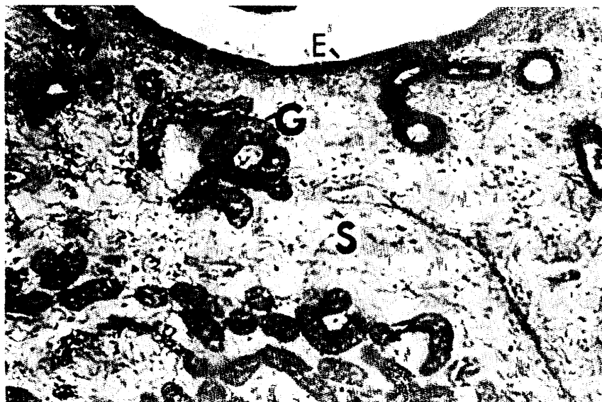
Figure 1. Uterine endometrium of the pig (S = stroma, G = uterine gland, E = luminal epithelium).